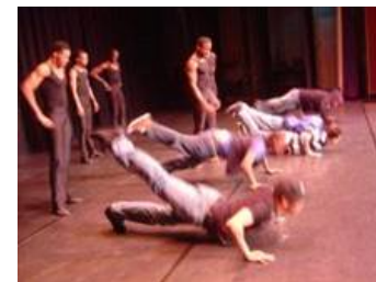
Above, left: Dancers' performance of Rosa Parks taking a front seat on the bus. Right: Members of the audience display their workout skills.