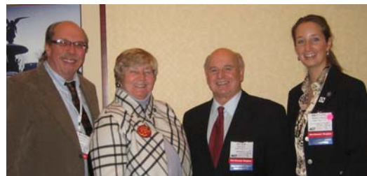
ACCers presented at the ACCT conference.