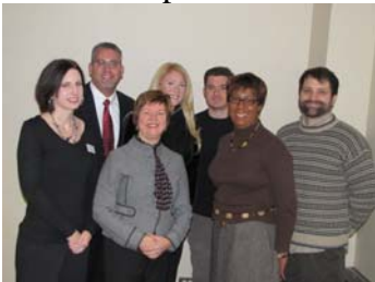
College relations staffers.

Atlantic Cape earned statewide and regional recognition this fall for its public relations and marketing efforts, including being recognized as the top social media program for community colleges in the Northeast.