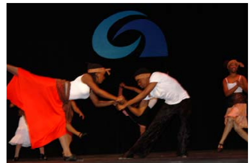
The Patti Harris Dance Troupe performed as part of ACCC's Black History celebration.