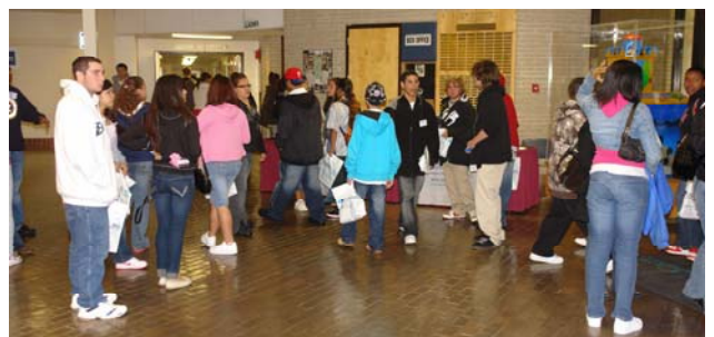
C building lobby was bustling with high school students on College Awareness Day May 9.

Approximately 300 area middle and high school students from area schools attended the May 9 College Awareness Day at the Mays Landing Campus. The event featured numerous workshops, speakers, entertainment and other activities geared toward exposing students to higher education. There also were workshops focusing on teen issues such as sexual health, business economics and the impact of student athletes on campus life.