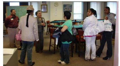
Community members saw the Health Professions Institute and CCI as part of their tour.