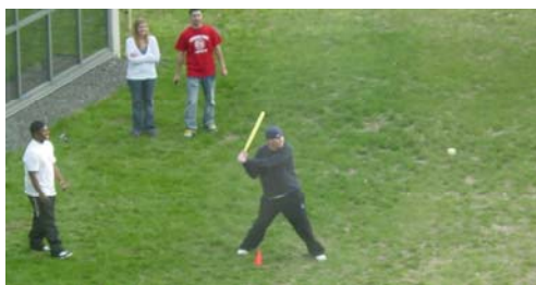
CMCC students took advantage of a nice sunny day this week and played volleyball in the back yard. After the volleyball games, a whiffle ball game broke out. It's great to see student activity at CMCC!