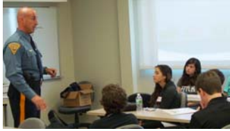
Fifteen high school students spent four information-packed days at CMCC previewing careers in law enforcement and public safety.