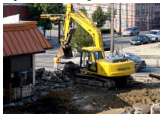
Work is under way on the demolition of the former Fish Heads restaurant.

The fall semester kick-off was a rousing success with welcome back greetings from the Worthington Atlantic City Campus staff. Faculty and staff enjoyed special “Welcome Back Breakfasts” Sept. 7 and 8. Our bookstore and cafeteria are back in business and demolition and rebuilding of the parking lot is in full swing.