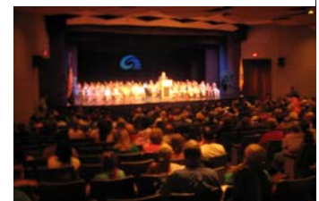
The Walter Edge Theater was brimming with Atlantic County residents on Aug. 29 as they gathered for the annual Grandparent’s Day celebration and recognition event.